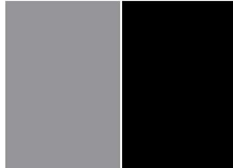
1/1 page | 216mm x 303mm