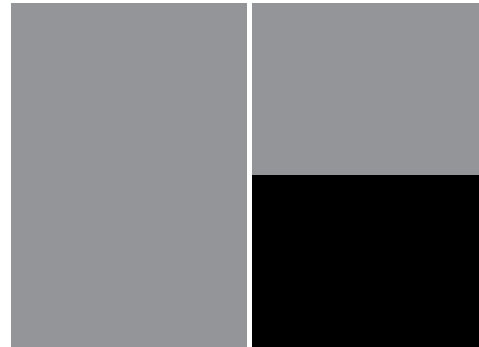
1/2 page horizontal | 152mm x 216mm